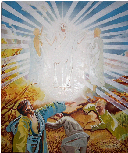
Transfiguration of Christ by Jason Polintan